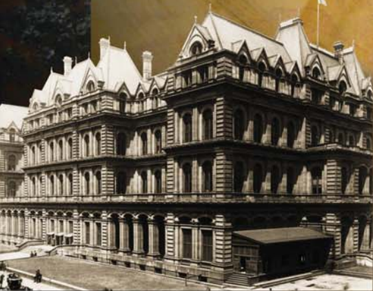
U.S. Post Office and Custom House, Chicago, Illinois