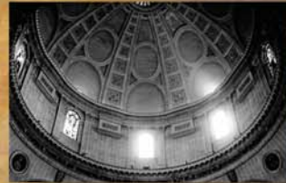
Interior of dome before murals

The parish suffers from a staggering construction debt. Rumors circulate about the church being turned into an opera house. The Conventual Franciscan Friars assume ownership and pastoral care of the parish at the request of Archbishop Messmer.