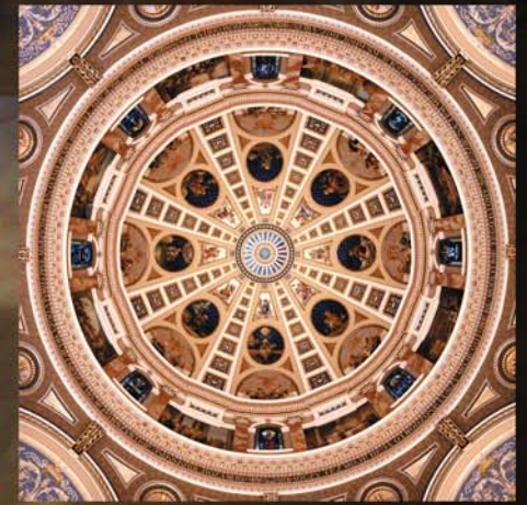
Interior of dome after murals