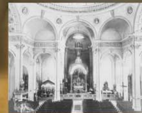
Interior of sanctuary before murals

2000 The Basilica of St. Josaphat celebrates the Holy Year of the Great Jubilee with the opening of the Pope John Paul II Pavilion.