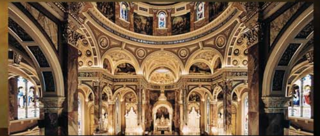
Interior of sanctuary after murals